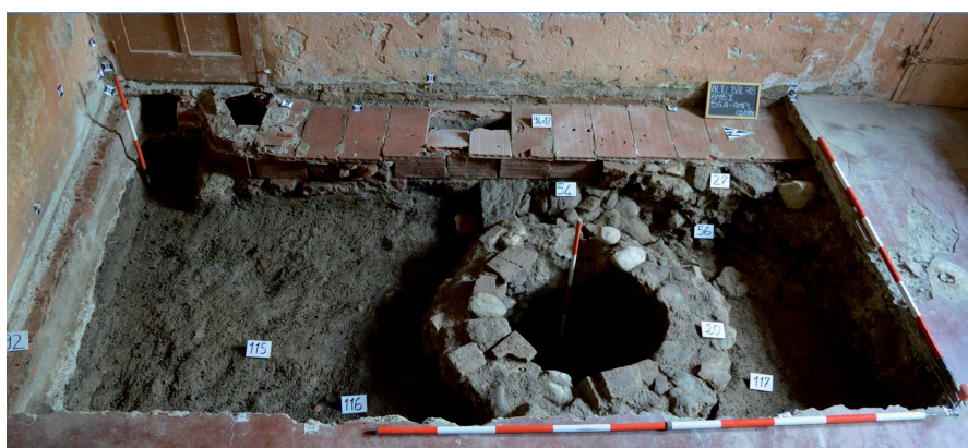
Fig. 2 Site of Altare.