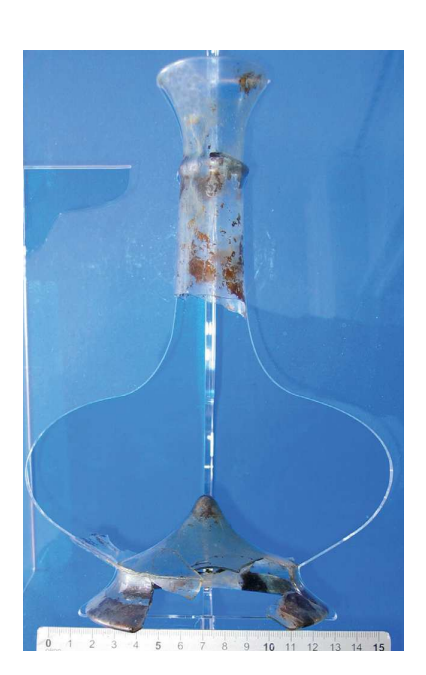
Fig. 4 Bottle from Savona.

B: Rb/Sr in the in archaeological finds (graphic by Prof.ssa Maria Pia Riccardi, copyright of University of Pavia).