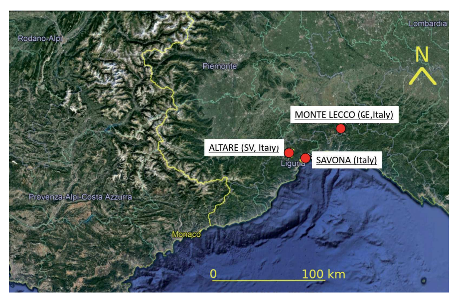
Fig. 1 Location of Altare, Savona, Monte Lecco.