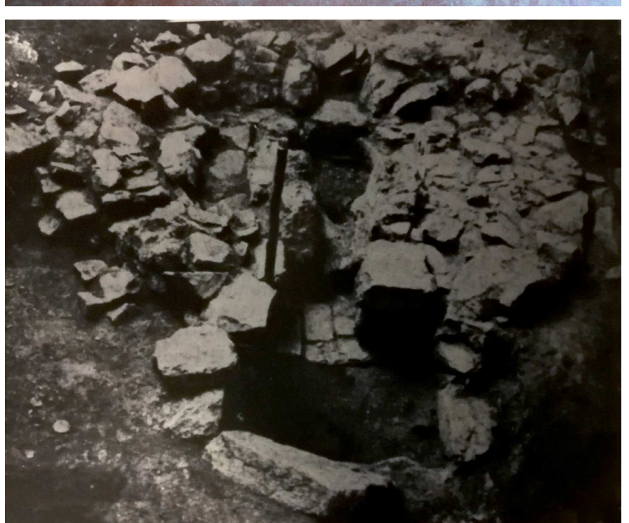
Fig. 3 Site of Monte Lecco (d'après Fossati, Mannoni 1975, 124).